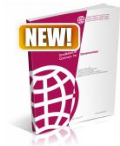
Construction Contract 2nd Ed (2017 Red Book)