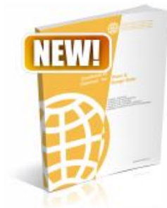
Plant and Design-Build Contract 2nd Ed (2017 Yellow Book)