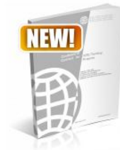
EPC/Turnkey Contract 2nd Ed (2017 Silver Book)